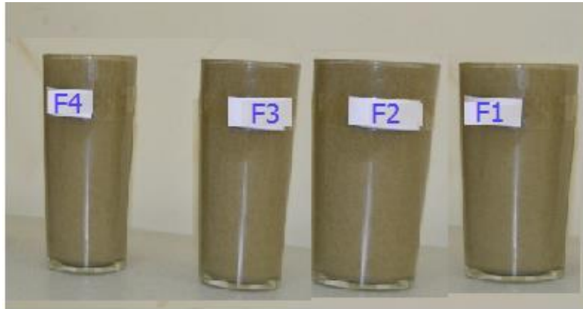
Fig. 2: F1: formulation 1; F2: Formulation 2; F3: formulation 3; F4: Formulation 4. Formulation 1 = Teff (35%) , lentils (15%), sweet potatoes (20%), white corn (10%), wheat (15%) and rice (5%), Formulation 2= Teff ( 50%) , lentils (5%), sweet potatoes (20%), white corn (5%), wheat (10%) and rice (10%), Formulation 3= Teff (15%) , lentils (6.5%), sweet potatoes (18.5%), white corn (10%), wheat (30%) and rice (20%) and Formulation 4= Teff ( 30%) , lentils (10%), sweet potatoes (10%), white corn (25%), wheat (13%) and rice (12%).

carbohydrate content not exceed 17g per 100 kilocalories ( Table4 ).