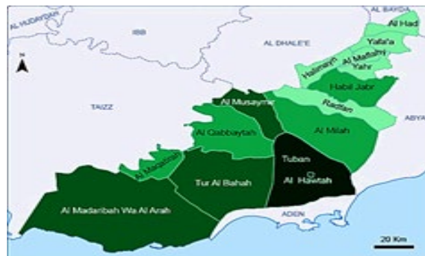
Fig. 1: Lahaj Governorate, Yemen

Lahaj Governorate ( Fig. 1 ) is situated in the south west of the Republic of Yemen at longitude (43°-46°) east Greenwich, and between latitude (12°-14°) north of the Equator. It's far from the capital of Sana'a, where it is located in the south-eastern part of it, about (337Km 2 ), an area with fertile soil, because it is located on the Delta of Tuban, and is characterized by prosperity in agriculture.