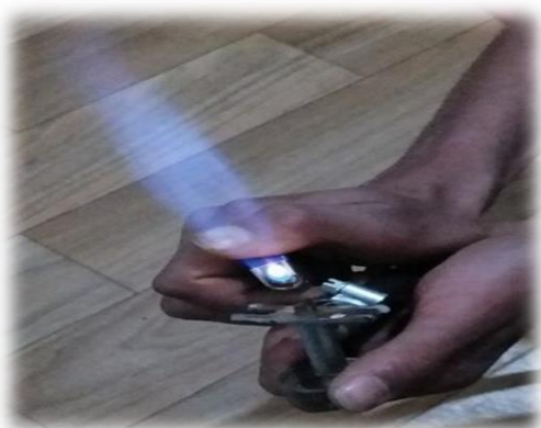
Figure 4: biogas

In a preliminary study of biogas production and it has been tested of the ignition, lightening of the blue color flame was indicated for presence of methane as shown fig 4