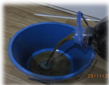
Figure 3: biogas slurry

In a preliminary study of biogas production and it has been tested of the ignition, lightening of the blue color flame was indicated for presence of methane as shown fig 4