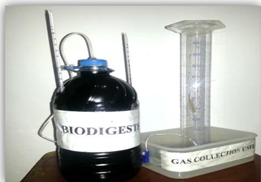
Figure 1: biogas digester.

Cow dung sample and biogas slurry were measured by pH meter (JENWAY Company, UK).